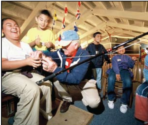
E Where can you watch deer and other wildlife from a boat with your whole class?

Where can you catch a swordfish, marlin, and sea bass in one "Reelly" fun day?