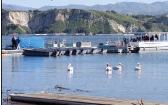
F Where can you learn about the roots of the Santa Barbara community?