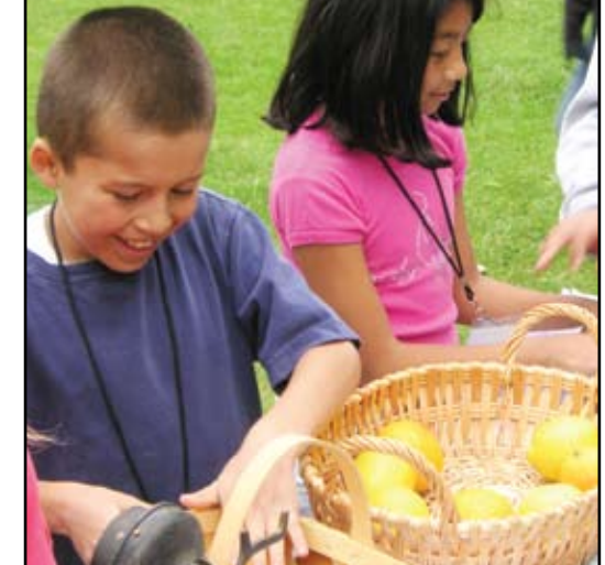
K Where can you play "Citrus Ranch Manager" for the day?