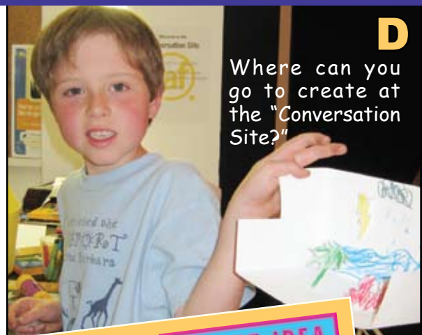
D Where can you go to create at the "Conversation Site?"

Dear Kids, Get ready to hit the road to exploration. Passports are coming! The Santa Barbara Educators' Roundtable invites you to visit local education centers, gardens, museums, and public lands and libraries with your Passport to Santa Barbara County. If you are in kindergarten through 6th grade and have a Passport, or every kid in your group has a Passport, YOU, plus one adult 16 or older, get FREE entry to ALL participating institutions (listed below). A fun activity awaits you at each place and, you get a stamp in your Passport booklet for each finished activity. Collect eight stamps by April 30, 2009, and get a FREE T-SHIRT.