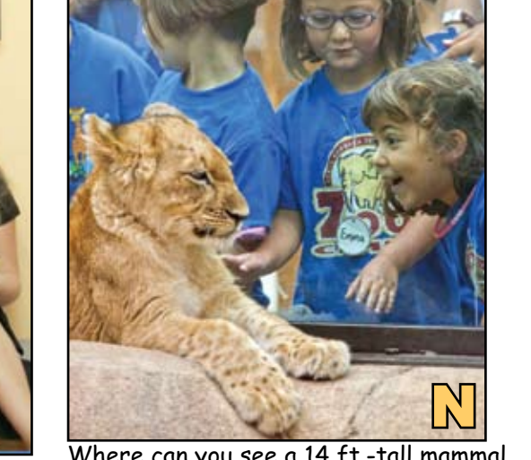
N Where can you see a 14 ft.-tall mammal, an endangered California bird, and a 15 ft.-long reptile named "Chief"?