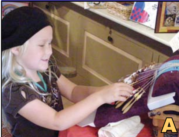
A Where can you learn about the ancient art of lace making — and even try it yourself?

Where can you catch a swordfish, marlin, and sea bass in one "Reelly" fun day?