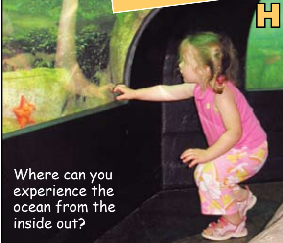
H Where can you experience the ocean from the inside out?