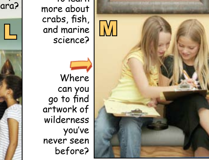
M Where can you go to find artwork of wilderness you've never seen before?