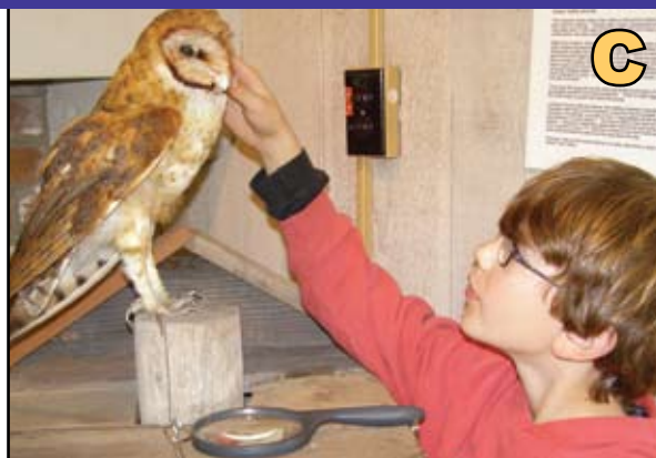
C Where can you go to pet a barn owl, use a microscope, watch live birds at a feeder, and see a miniature traditional Chumash village?