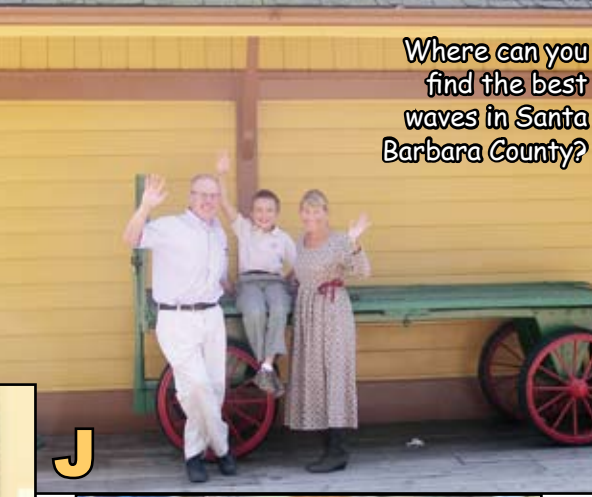
J Where can you find the best waves in Santa Barbara County?